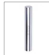
calibration gauge (included)